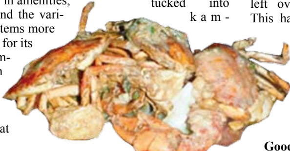
Crab with salted egg yolk

it was wild boar; again at RM15 per portion, great value. But do order in advance as they don't always have stock. We then tucked into k a m -